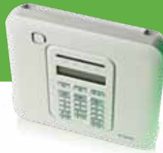
PowerMaster-10 G2 30-zone control panel