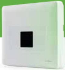
PowerMaster-33 G2 Distributed wireless alarm