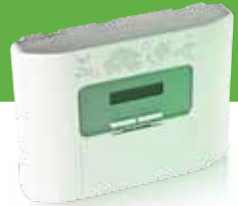
PowerMaster-30 G2 64-zone control panel